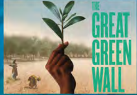
The Great Green Wall | Africa Feb. 16