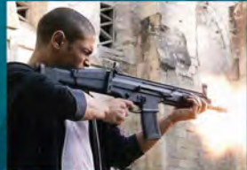
Made in France | France Mar. 9