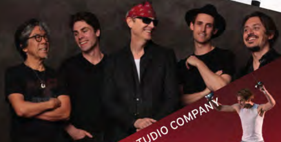
ABT STUDIO COMPANY