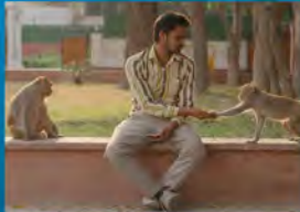
Eeb Allay Ooo! | India Feb. 23