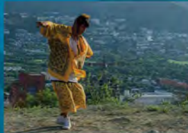
I'm No Longer Here | Mexico/NYC Mar. 2