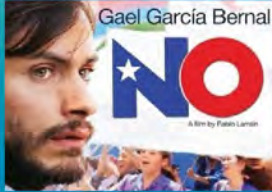
No | Chile Feb. 2 RESCHEDULED TO MARCH 16

Global Flicks is co-sponsored by Field and Experimental Learning/Study Abroad and McAninch Arts Center.