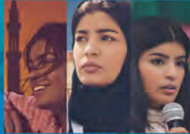
The Perfect Candidate | Saudi Arabia Feb. 9