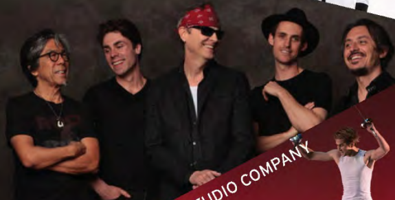
ABT STUDIO COMPANY