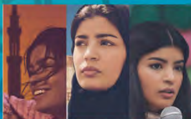
The Perfect Candidate | Saudi Arabia Feb. 9