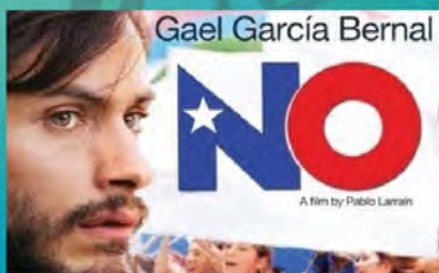
No | Chile Feb. 2 RESCHEDULED TO MARCH 16