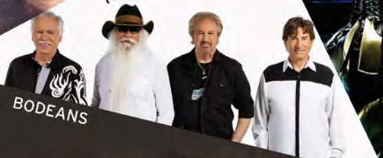
THE OAK RIDGE BOYS