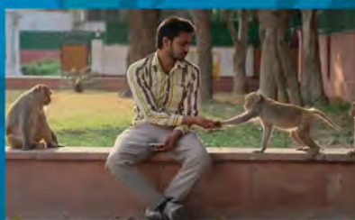
Eeb Allay Ooo! | India Feb. 23