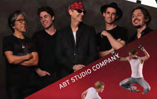
ABT STUDIO COMPANY