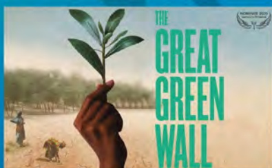
The Great Green Wall | Africa Feb. 16