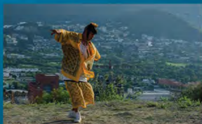
I'm No Longer Here | Mexico/NYC Mar. 2