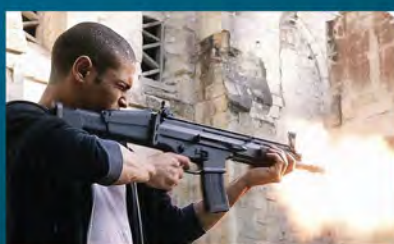
Made in France | France Mar. 9

Enjoy these acclaimed international films followed with guided talkbacks by COD faculty. Films shown in original language with English subtitles.