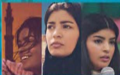
The Perfect Candidate | Saudi Arabia Feb. 9