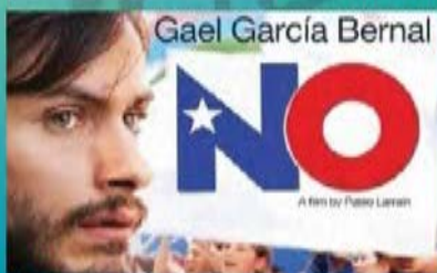
No | Chile Feb-2 RESCHEDULED TO MARCH 16