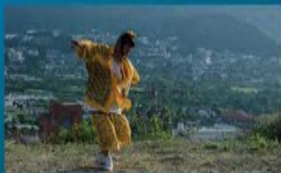
I'm No Longer Here | Mexico/NYC Mar. 2