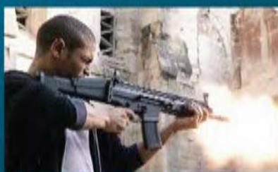
Made in France | France Mar. 9

Enjoy these acclaimed international films followed with guided talkbacks by COD faculty. Films shown in original language with English subtitles.