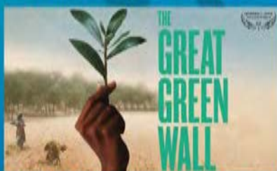
The Great Green Wall | Africa Feb. 16