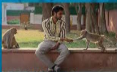
Eeb Allay Ooo! | India Feb. 23