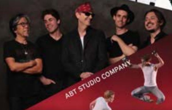
ABT STUDIO COMPANY