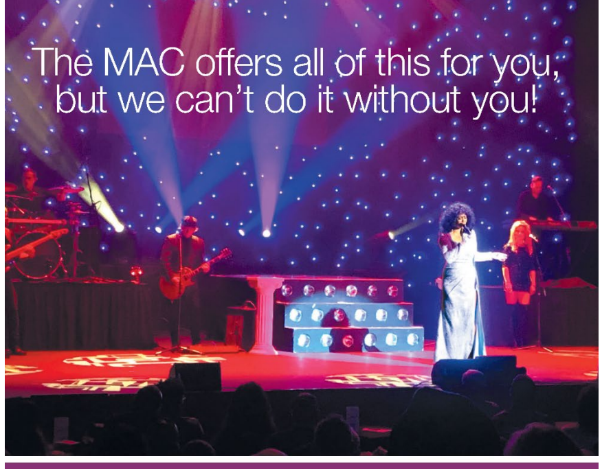
YOUR GIFT HELPS PROVIDE CULTURAL VITALITY THAT ENRICHES AND ENTERTAINS!